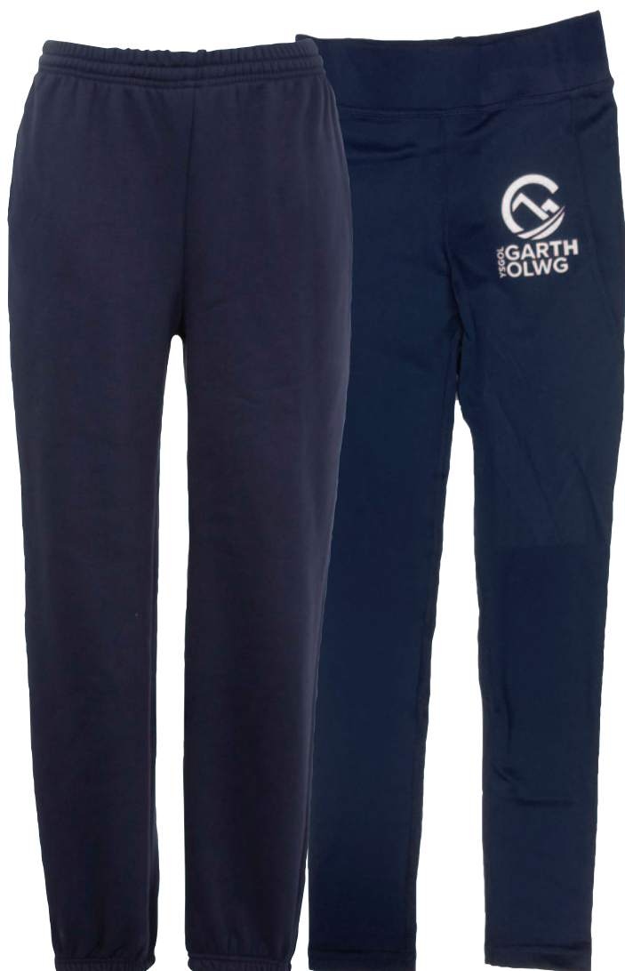
Plain Tracksuit Bottoms/Joggers or Leggings