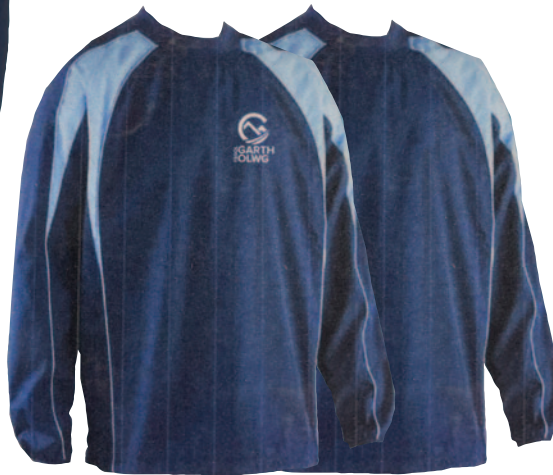
Round neck rain jacket