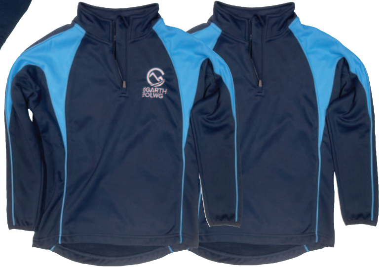
1/4 Zip Top