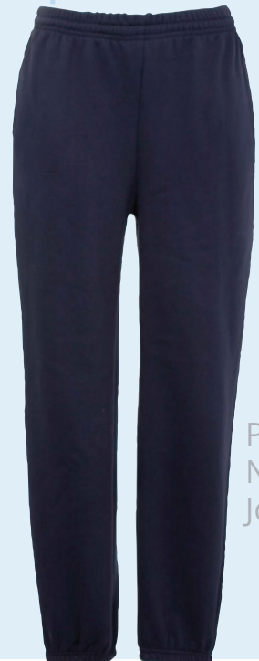
Plain Navy Joggers